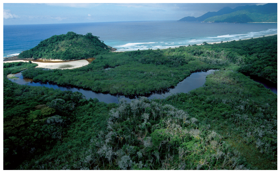
The Atlantic Forest (Mata Atlântica)