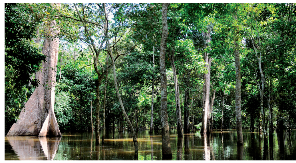
Amazonia (the Amazon Rainforest)

Amazonia is also called the Amazon Rainforest. It is the biggest ecosystem in Brazil, and it is the biggest rainforest in the world. Amazonia is five million square kilometers. Sixty percent of the forest is in Brazil. The other 40% is in Peru, Colombia, Venezuela, Ecuador, Bolivia, Guyana, Suriname, and French Guiana.