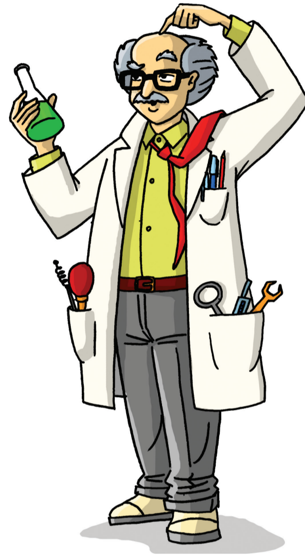
Grandad an inventor