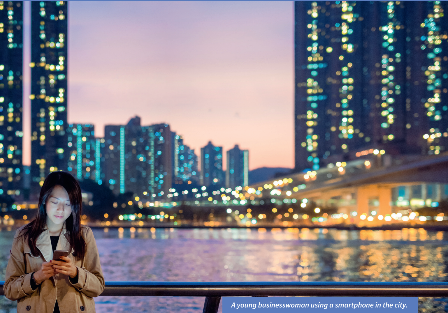
A young businesswoman using a smartphone in the city.