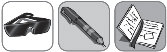
A B C

5 What are they probably going to do tomorrow?