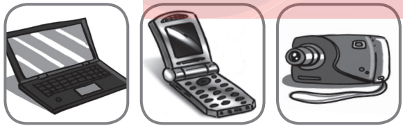
A B C