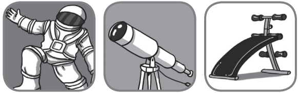
A B C