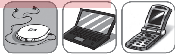
A B C