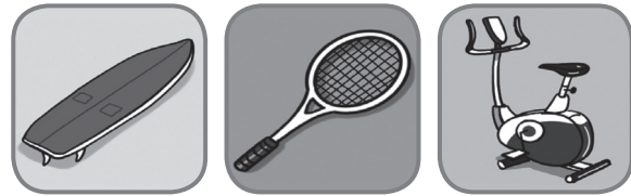
A B C

5 What are they probably going to do tomorrow?