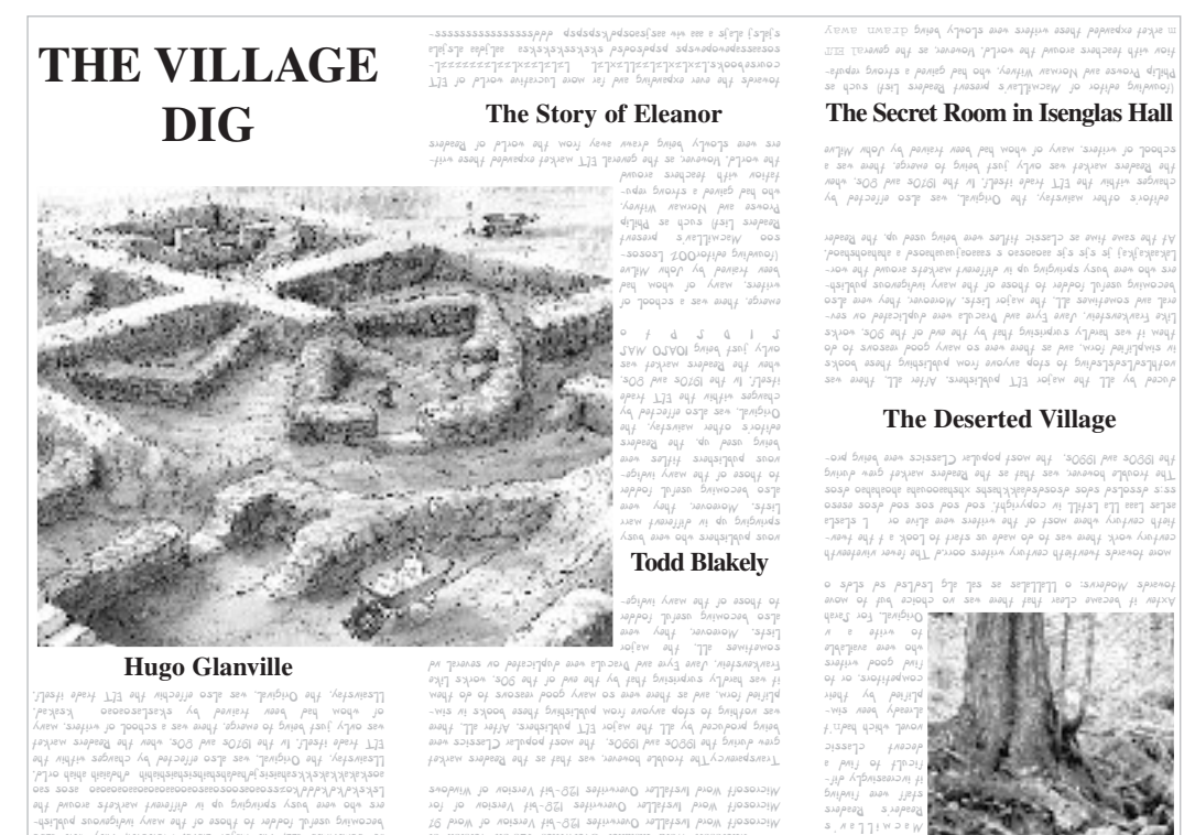
10 Write a diary page for an important day in the life of Hugo Glanville. Use your notes from Question 5.