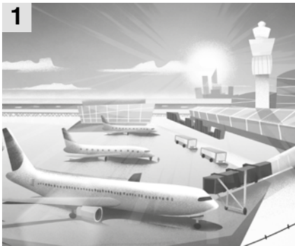
1 It's a sunny day at the airport.