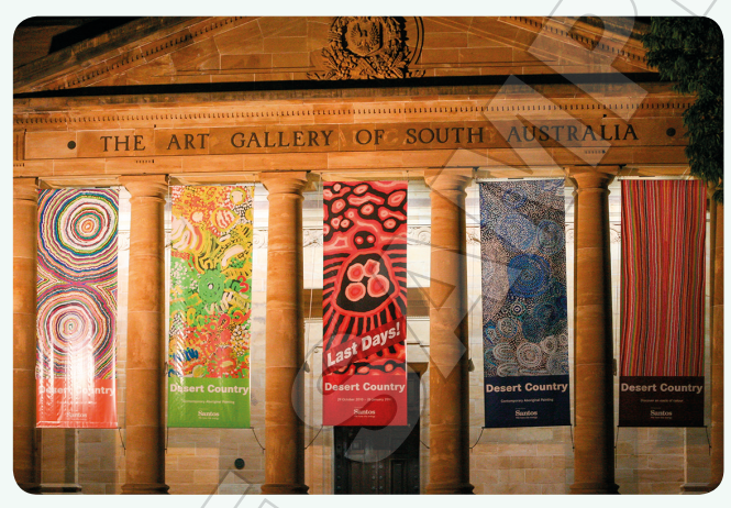
The Art Gallery of South Australia

Work in pairs. Discuss different ways to say the underlined words and phrases in the students' answers in Exercise 3.