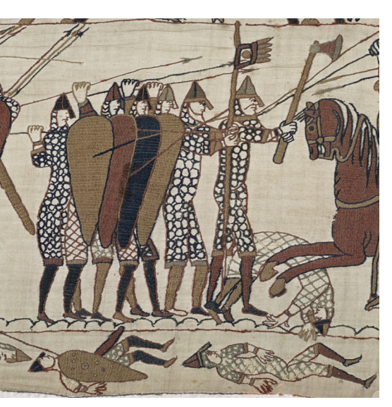
The Bayeux Tapestry

The French made a beautiful tapestry showing the story of William's invasion of England and the Battle of Hastings. You can see this today in Normandy.