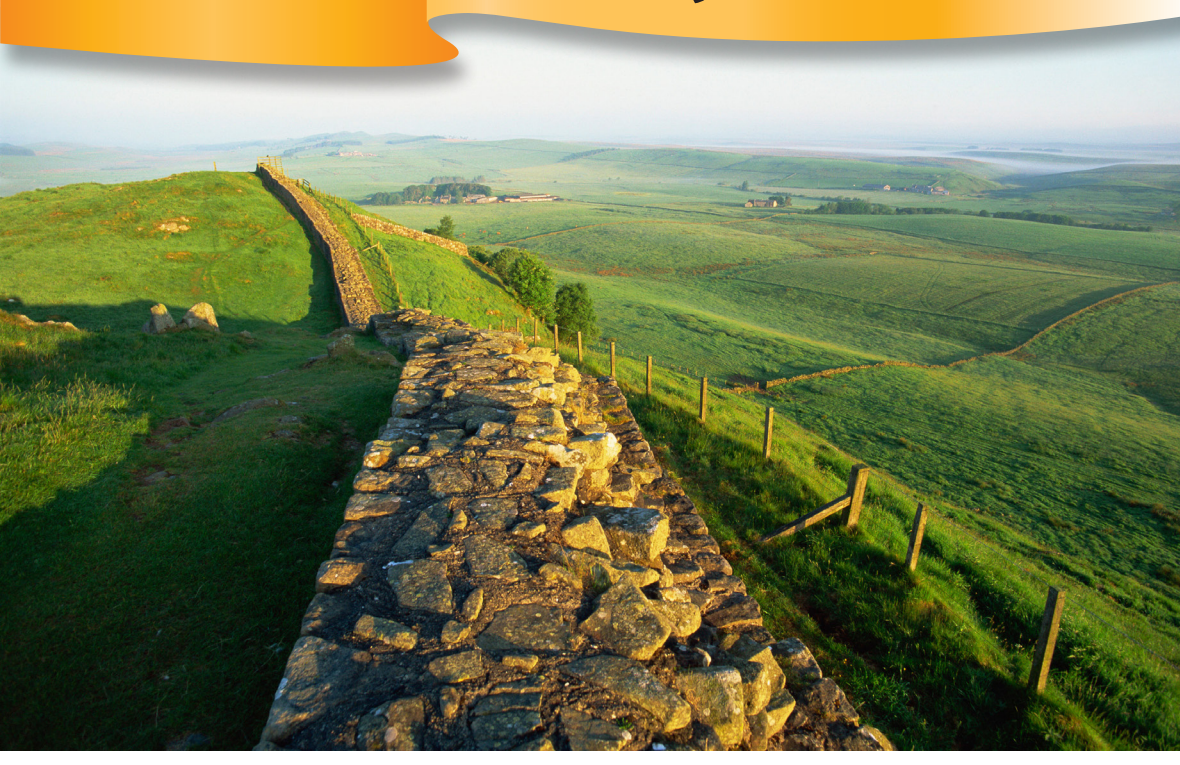
Hadrian's Wall, built by the Romans

Back in England's oldest times, people lived in big groups called tribes. They were farmers – they grew their food, and kept animals for meat and eggs. They lived in villages, in wooden or mud<sup>4</sup> houses, and there was often fighting between the different tribes. Life was simple but dangerous.