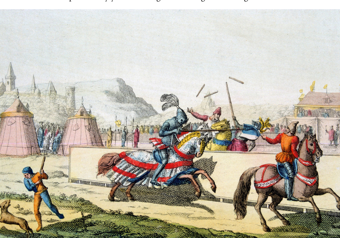
Armoured knights jousting at a tournament in the Middle Ages

Religion was very important in the Middle Ages, and the Catholic Church became very powerful. From 1095 to 1291, soldiers went to other countries to fight religious battles. There was more fighting in the fourteenth and fifteenth centuries, as France and England fought the Hundred Years War, hoping to win land from each other. Many of the battles of the Hundred Years War were fought by knights. As well as fighting battles for nobles and for the king, knights also fought as a sport in competitions<sup>15</sup> called jousting tournaments. Young men who wanted to become knights had to spend many years learning all the things that a knight could do.