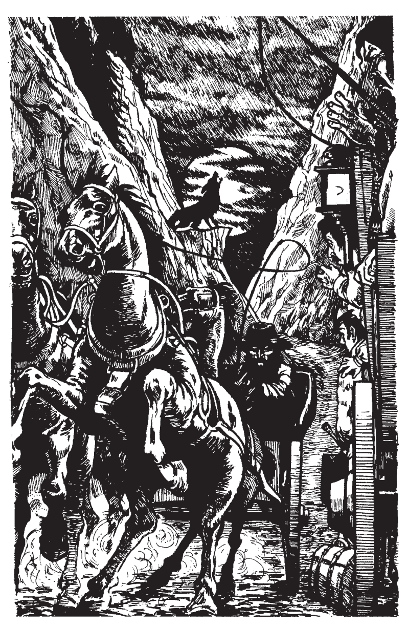
Down the narrow road came a small carriage, pulled by four black horses.